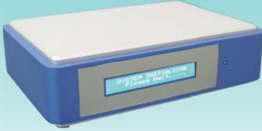
LCM ver. ( 3V700D / 3I270D )