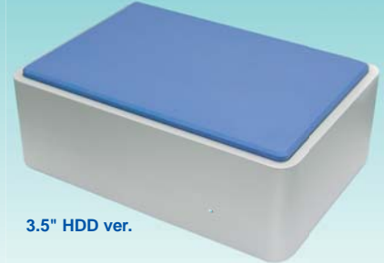
3.5" HDD ver.