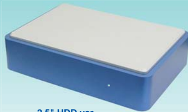
2.5" HDD ver.