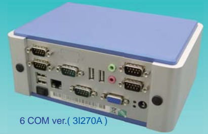
6 COM ver.( 3I270A )