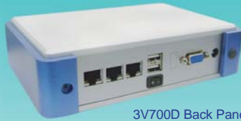
3V700D Back Panel