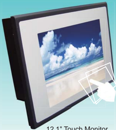
12.1" Touch Monitor