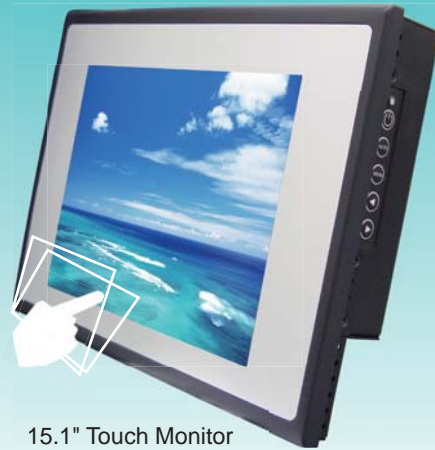
15.1" Touch Monitor