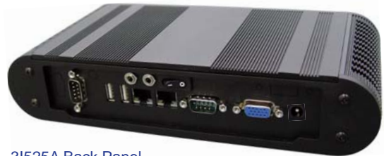
3I525A Back Panel